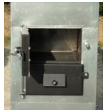
Raccolta ceneri Ash collecting Recolección cenizas