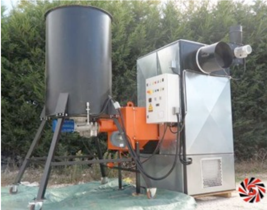
WARM AIR GENERATOR WITH AUTOMATIC LOADING