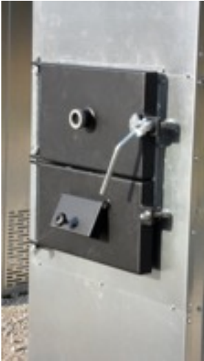
Portello di apertura focolare Fireplace opening door Puerta apertura focolar