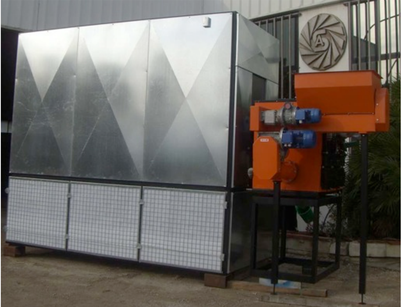
WARM AIR GENERATOR 500.000 Kcal/h Automatic loader system + Big Charlie burner for virgin wood wastes