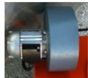
Electrofan for manage the flame